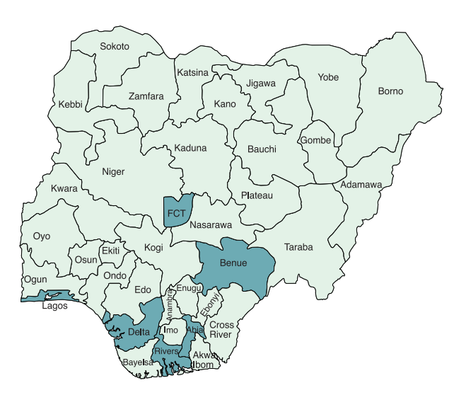
Geographic locations of the ICC

This project aimed to increase and accelerate the progress of Pediatric HIV and PMTCT services by leveraging available resources and progress made in Nigeria through sustainable strategies that strengthen both facility-level and community-level interventions. The project focused on five states, namely Abia, Benue,