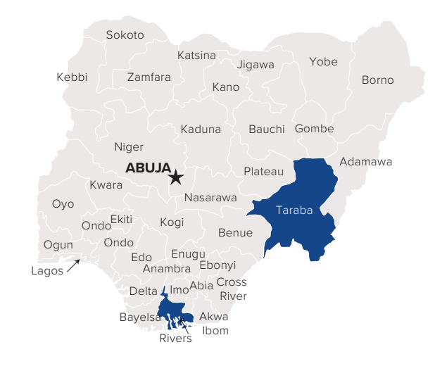
Figure 1. EID Optimization Project States in Nigeria

The project aimed to provide technical assistance to increase overall EID coverage by leveraging existing resources including the current EID testing platforms, EID sample and result processing logistics, and the support network of Mentor Mothers. The project objectives were to first identify key barriers in the EID cascade in the two states then, utilizing EGPAF's validated Program Optimization Approach (POA), train and support health providers to apply Quality Improvement (QI) approaches to the identified gaps and, finally, to share promising tools and resources for adaptation in other similar settings. These activities culminated in generating evidence including a toolkit to strengthen national EID implementation.