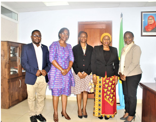
From the right is EGPAF Tanzania Country Director, Hon. Minister for Health, Former Country Director for EngenderHealth, Country Director for Amref Health Africa, and Senior Results Manager for Dodoma.