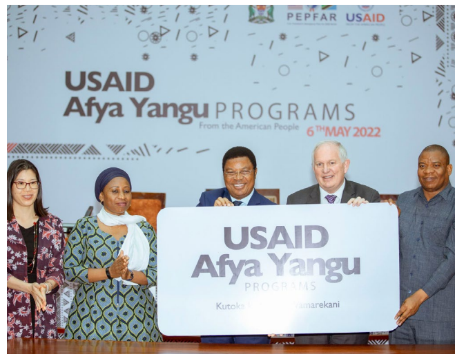
Photo of the USAID Afya Yangu Program Launch Event officiated by Hon. Prime Minister for Tanzania and hosted by Hon. Minister for Health.