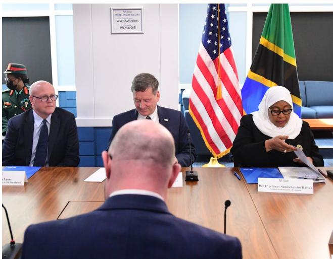
Photo of the round table meeting at Woodrow Wilson International Center for Scholars on April 22, 2022, in Washington, D.C., with partners and the President of Tanzania.