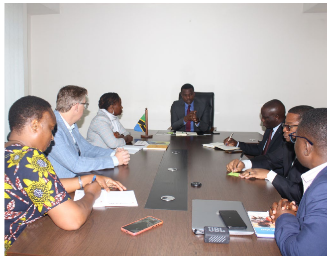
Photo of the meeting with the minister and representatives of the President's Office – Regional Administration and Local Government with EGPAF's management team.