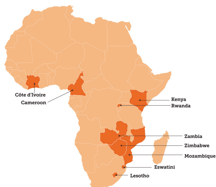
FIGURE 1: Focus countries for point-of-care EID introduction

Through funding and support from Unitaid, EGPAF leveraged its presence and experience in pediatric diagnosis, care, and treatment in nine African countries to integrate point-of-care early infant diagnosis of HIV (POC EID) into national laboratory systems. The countries were Cameroon, Côte d'Ivoire, Eswatini, Kenya, Lesotho, Mozambique, Rwanda, Zambia and Zimbabwe . Across the nine countries, the routine use of POC testing technologies aimed to achieve national targets for pediatric HIV testing, care, and treatment by reducing gaps in EID services, with the specific objectives to: