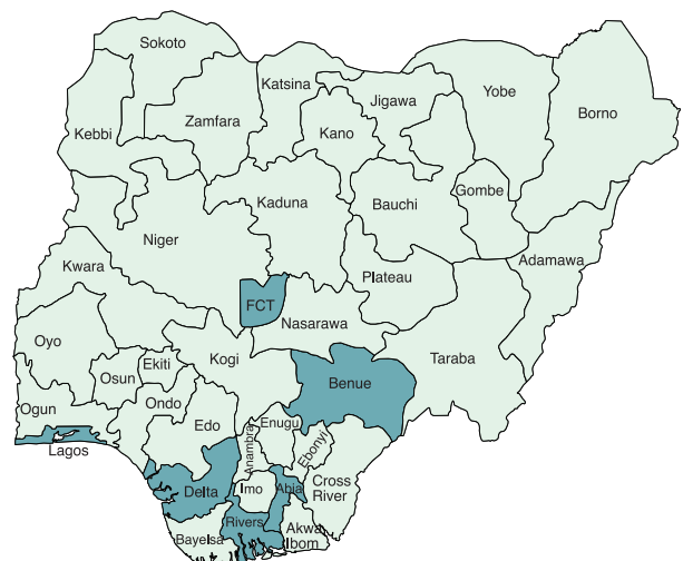
Geographic locations of the ICC

This project aimed to increase and accelerate the progress of Pediatric HIV and PMTCT services by leveraging available resources and progress made in Nigeria through sustainable strategies that strengthen both facility-level and community-level interventions. The project focused on five states, namely Abia, Benue,