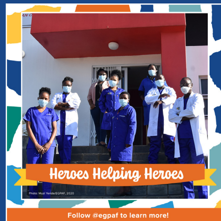
Follow @egpaf to learn more!

For the latest information about our programs, stories of impact, and progress toward creating an AIDS-free generation, please visit pedaids.org or follow us on social media.