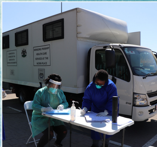
Top Left Photo: Muzi Yende/EGPAF, 2020, Top Right Photo: Anthony Kushaba/EGPAF, 2020