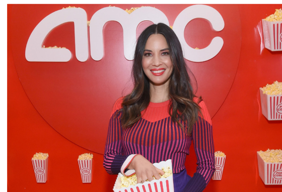
Celebrity Hero and Actress, Olivia Munn, enjoys popcorn in the AMC booth.