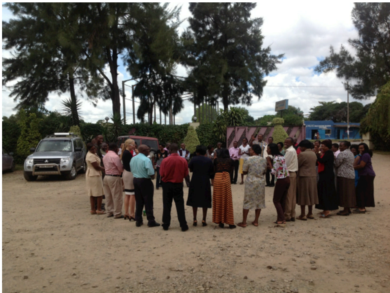
Fig. 5: Practical demonstration during the training for health workers

up-to-date records of those children seen and referred. They were also tasked with following up on referred children to determine whether appropriate action has been taken. This includes information about children referred to the Survive and Thrive units as well as from other sources.