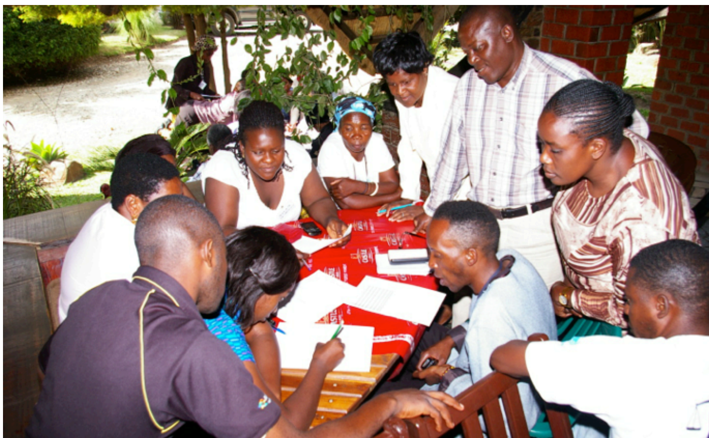
Fig. 3: Group work during sub-grantee orientation

Facilitators explained the Integrated Management in Childhood Illnesses (IMCI) program. Similar to one of the requirements of Survive and Thrive, the IMCI program promotes the use of affordable, locally available, healthy foods for use in cooking demonstrations. This activity benefits CBOs undertaking the nutritional and cooking aspect of the Survive and Thrive project.