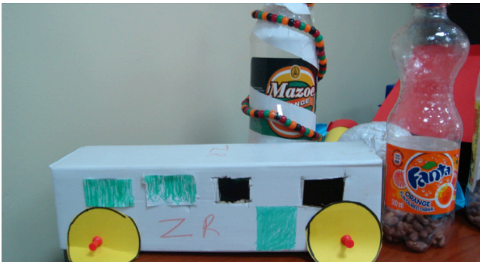
Fig. 4: Toys made during the Play Well workshop

The session on play included the video “Learning Through Play” and a practicum for making developmental toys. Participants were taught to make toys for use in assessing child development and enhancing gross, fine motor, cognitive, and social skills. Participants made toys from locally available materials: boxes, strings, waste paper, bottles, jar lids, grains, stones, and seeds. This emphasized that families need not spend large sums to promote and stimulate child development through play.