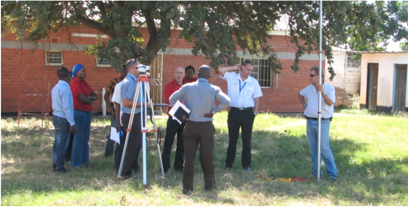
Fig. 6: A contractor and engineers from the Provincial Engineers Office inspect one of the proposed sites for a Survive and Thrive unit.