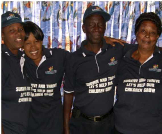
Fig. 2: Community volunteers from Mandevu, Lusaka

Trainers explained that Survive and Thrive was an innovative community-based service to assess and respond to the developmental needs of HIV-infected and HIV-affected children age 5 and younger, particularly those experiencing developmental delays.